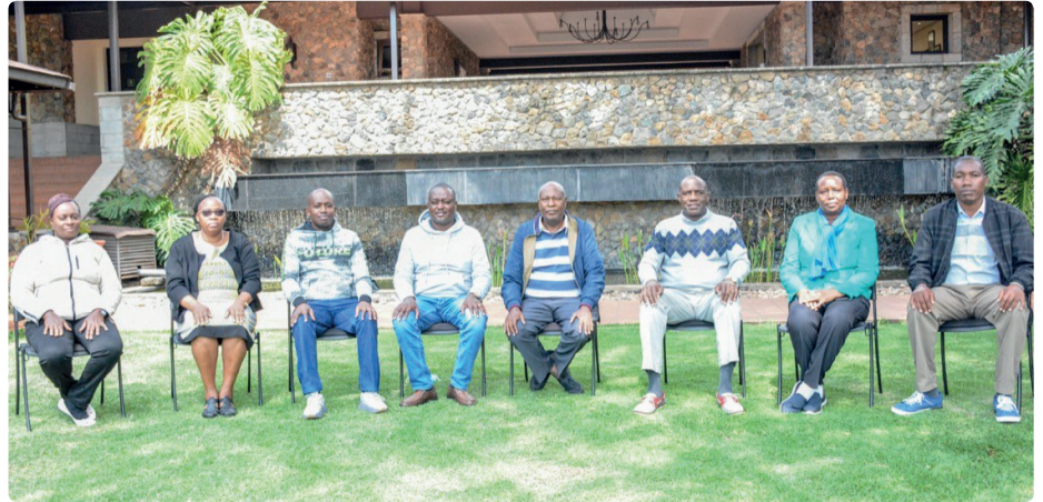
Members of the Board and Management undertaking the review of the policies at Great Rift Valley Lodge in Naivasha

Following the enactment of the Energy Act of 2019 which brought about expansion of REREC's mandates, the Corporation has been working on developing internal policies to define the Corporation's internal governance.